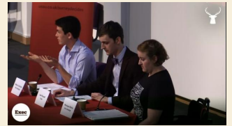
Referendum Debate Stage (2019)