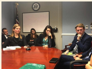
at US State Department (2019)