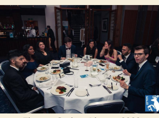
Finance Society Dinner (2020)