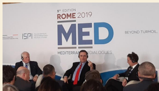
at ISPI MED2019

Fluent English Fluent Italian Advanced French Beginner Portuguese Attempting Mandarin