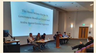
Debating UK Army Officers (2019)