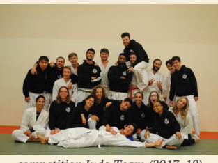
competition Judo Team (2017-18)