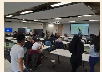
Univ. Investment Banking Event (2019)