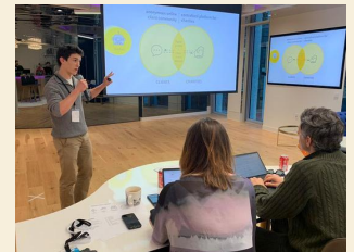
Presenting at BCG London (2019)